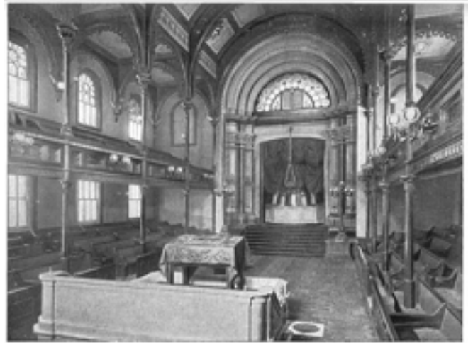
Mikveh Israel (1860) - Philadelphia