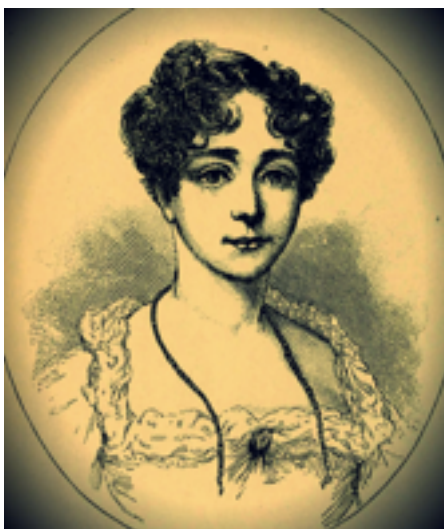
Lady Judith Montefiore