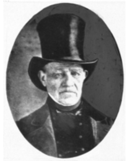
Judah Touro (New Orleans)