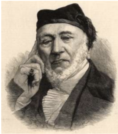
Sir Moses Montefiore