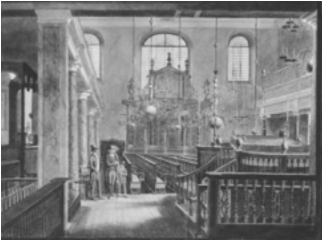
Bevis Marks Synagogue - London